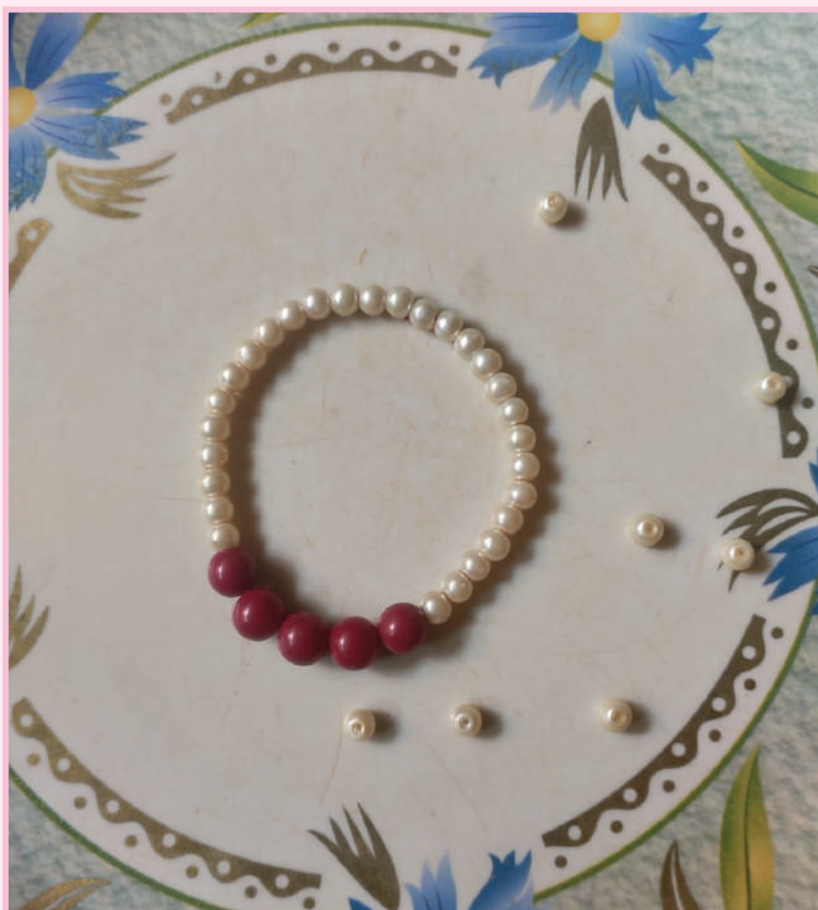
शहनाज़ वेगम Cms सब्दलपुर