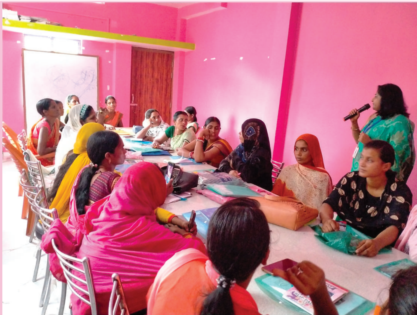
Jeevaka CM Training under MHM Awareness Programme