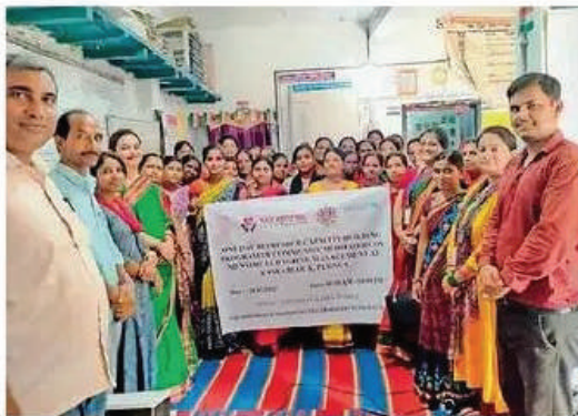
कम्युनिटी मोबिलाइजर के फ्रेशर ट्रेनिंग के दौरान प्रशिक्षक ।