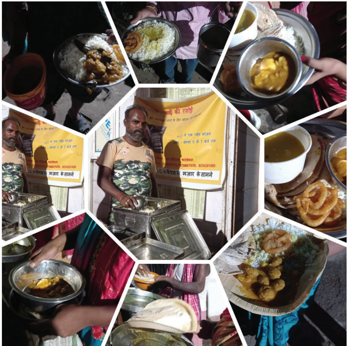
Hunger Project "Sai Ki Rasoi"