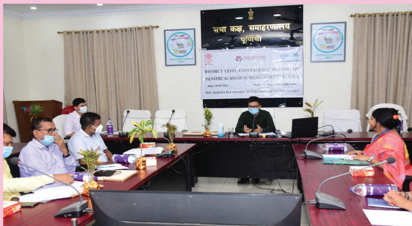
Convergence Meeting on MHM in collaboration with Jeevika - Purnia District