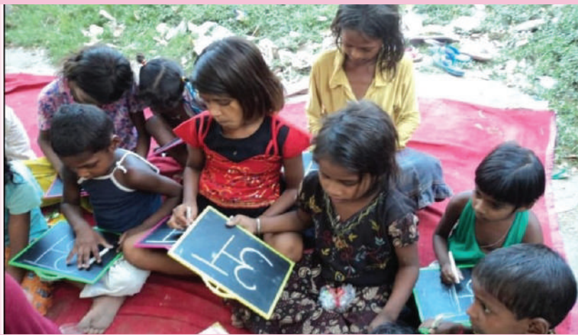
Basic Literacy Programme