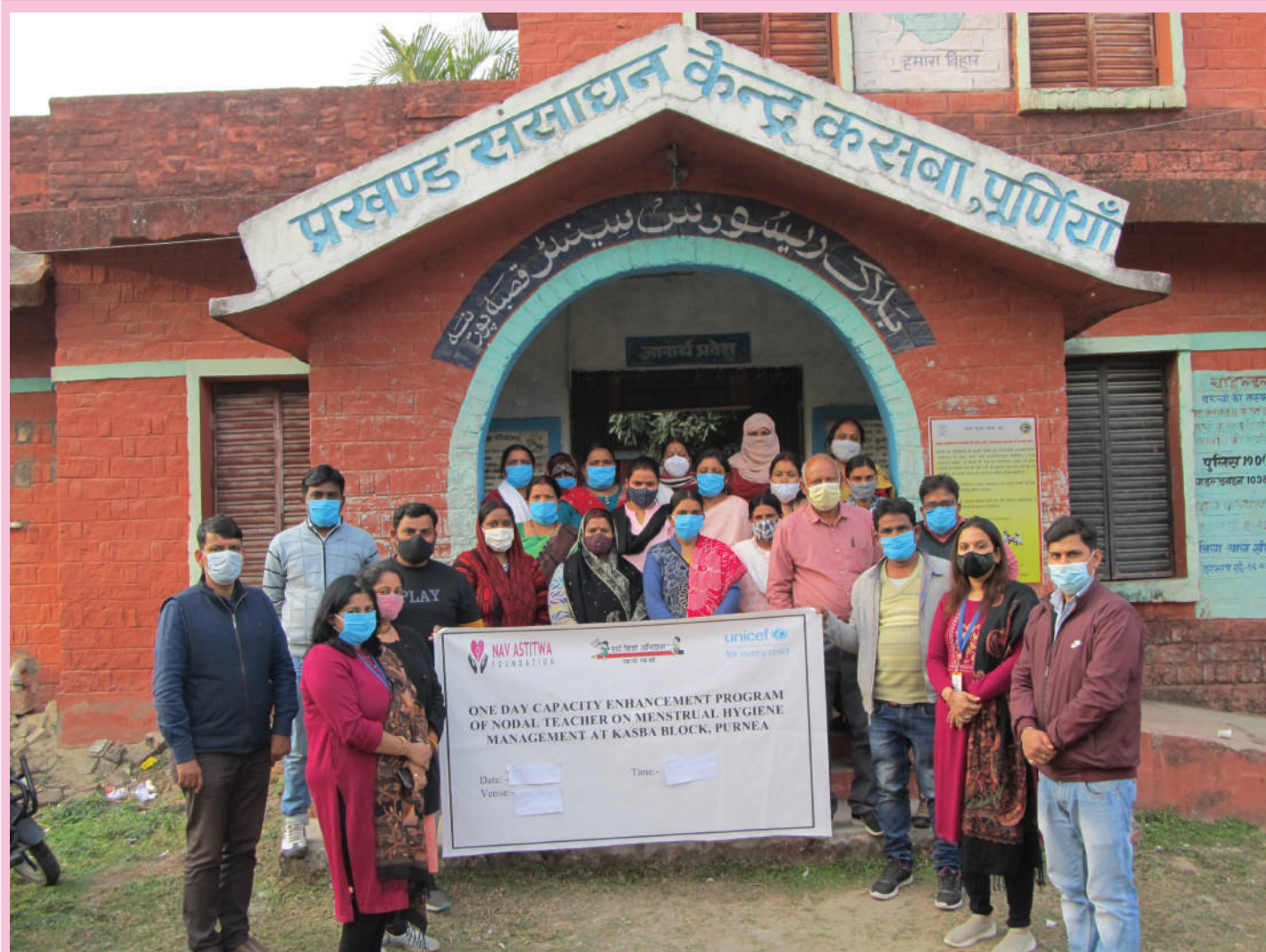
Nodal Teacher Training at Kasba Block of Purnia District