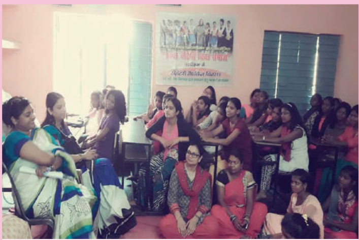
Swachh Betiyaan Swachh Samaj