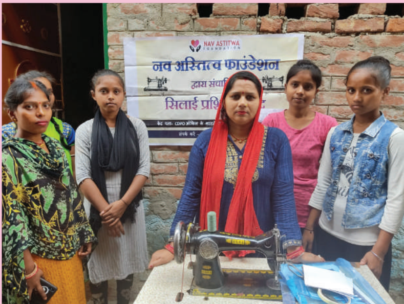
Empowering Women through Sticing