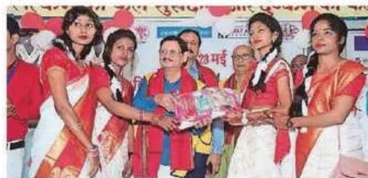
जिला स्कूल में माहवारी मिलन कार्यक्रम के दौरान उपस्थित अतिथि