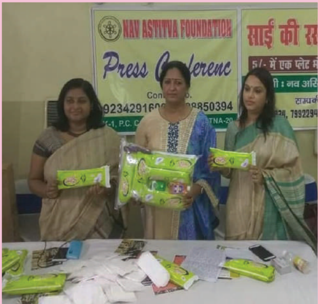
Launched MH Kit