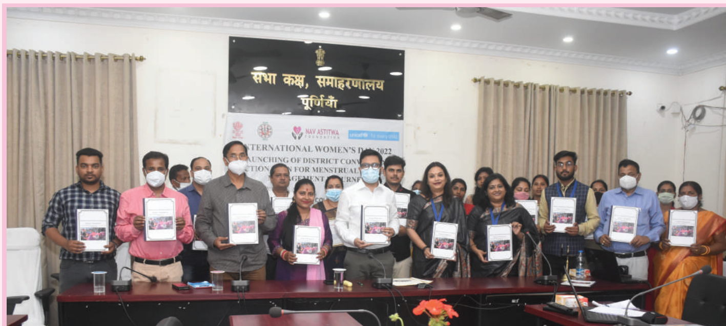
Convergence Meeting + Action Plan on MHM with Jeevika