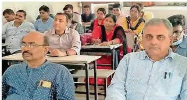
एकदिवसीय कार्यशाला में मौजूद एमओआईसी व अन्य स्वास्थ्यकर्मी।