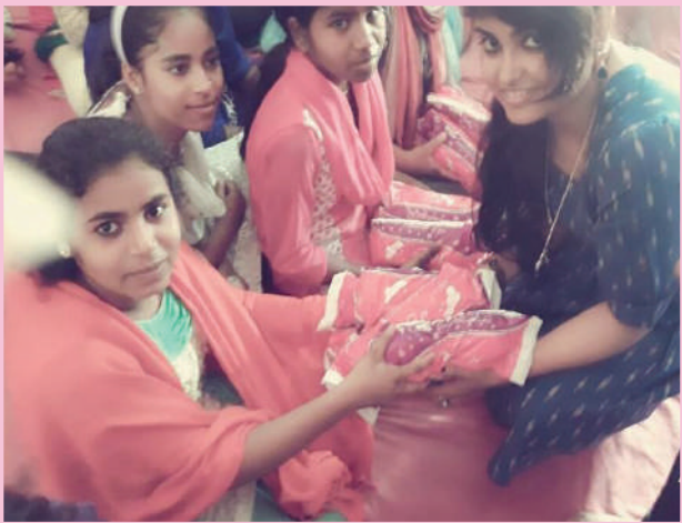
Sanitry Pad Distribution