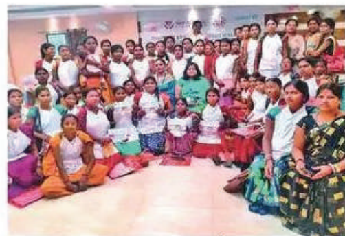
प्रशिक्षण में उपस्थित जीविका सीएलएफ कैंडरों की दीर्घा।