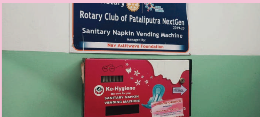
Installation on Sanitary Vending Machine