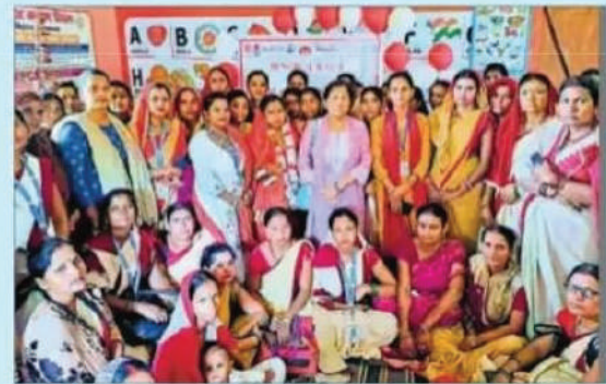
माहवारी उत्सव कार्यक्रम में उपस्थित प्रतिभागी गण ।